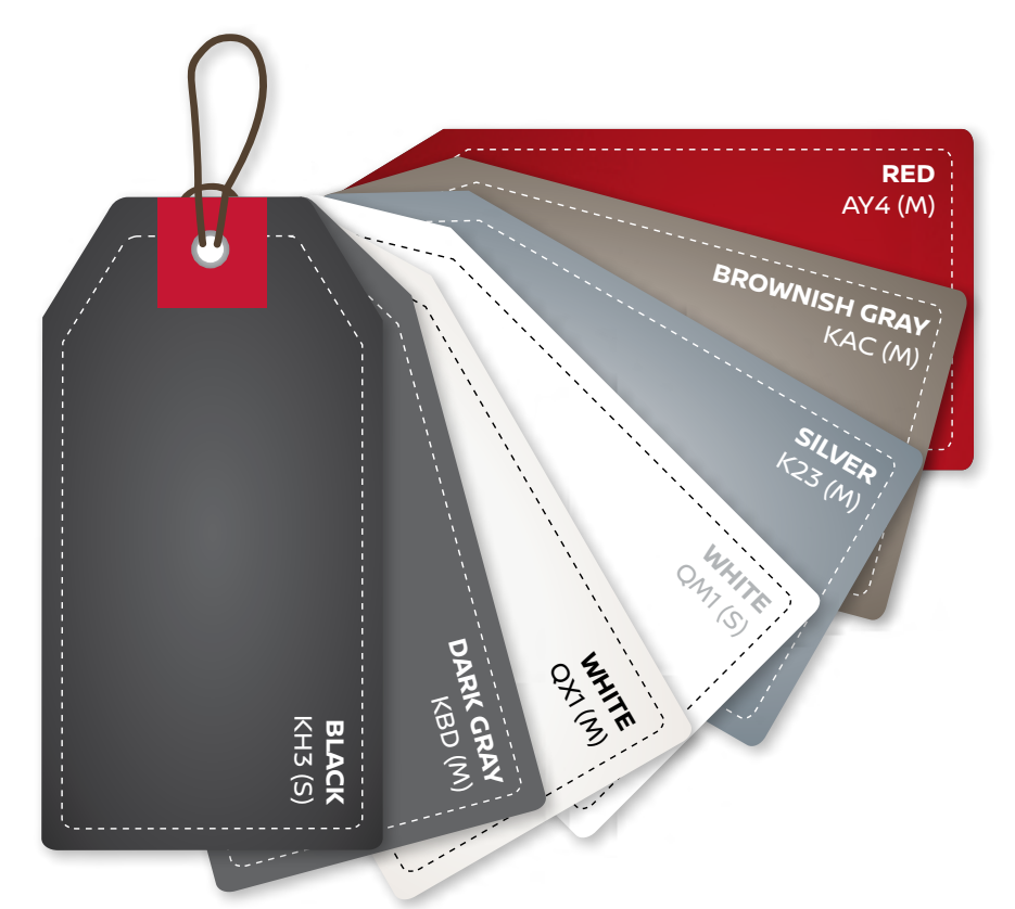
M - Metallic S – Solid